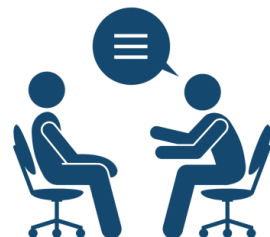
Figure 3: Cal-SOAP Service Offerings